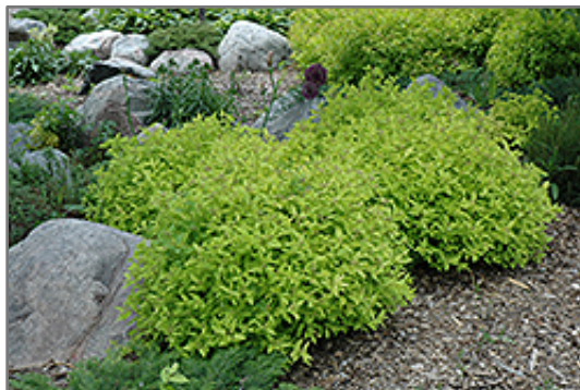
Goldmound Spirea

Goldmound Spirea is recommended for the following landscape applications;