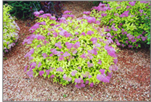
Goldmound Spirea in bloom

This shrub should only be grown in full sunlight. It prefers to grow in average to moist conditions, and shouldn't be allowed to dry out. It is not particular as to soil type or pH. It is highly tolerant of urban pollution and will even thrive in inner city environments. This is a selected variety of a species not originally from North America.