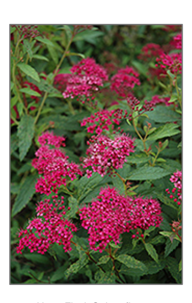
Neon Flash Spirea flowers

Neon Flash Spirea is covered in stunning clusters of cherry red flowers at the ends of the branches from late spring to early summer. It has attractive forest green deciduous foliage which emerges red in spring. The small serrated pointy leaves are highly ornamental and turn an outstanding coppery-bronze in the fall.