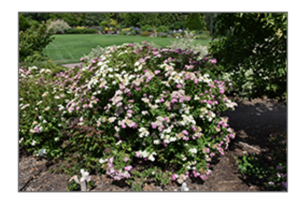
Shirobana Spirea in bloom

Shirobana Spirea is recommended for the following landscape applications;