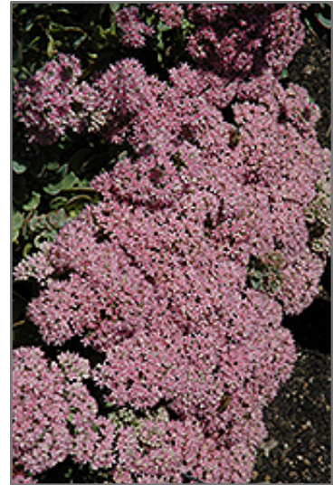
Lime Zinger Stonecrop flowers

This is a relatively low maintenance plant, and is best cleaned up in early spring before it resumes active growth for the season. It is a good choice for attracting bees and butterflies to your yard, but is not particularly attractive to deer who tend to leave it alone in favor of tastier treats. It has no significant negative characteristics.