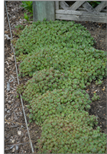
Lime Zinger Stonecrop

Lime Zinger Stonecrop will grow to be only 4 inches tall at maturity extending to 6 inches tall with the flowers, with a spread of 18 inches. When grown in masses or used as a bedding plant, individual plants should be spaced approximately 15 inches apart. Its foliage tends to remain low and dense right to the ground. It grows at a fast rate, and under ideal conditions can be expected to live for approximately 15 years. As an herbaceous perennial, this plant will usually die back to the crown each winter, and will regrow from the base each spring. Be careful not to disturb the crown in late winter when it may not be readily seen!