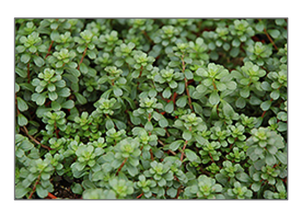
Salsa Verde Stonecrop foliage

Rounded gray-green leaves greet the eye with this lovely groundcover; excellent for rock gardens and containers; brightest leaf color usually occurs with some afternoon shade; not as cold hardy as most sedums