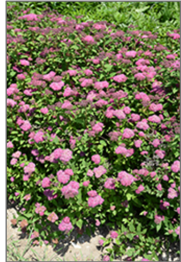
Double Play Artisan Spirea in bloom

This shrub should only be grown in full sunlight. It prefers to grow in average to moist conditions, and shouldn't be allowed to dry out. It is not particular as to soil type or pH. It is highly tolerant of urban pollution and will even thrive in inner city environments. This is a selected variety of a species not originally from North America.