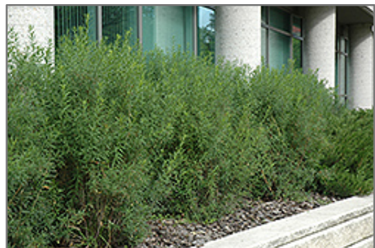
Dwarf Turkestan Burning Bush