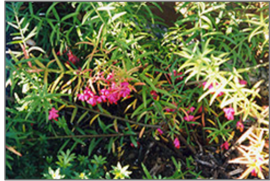
Dwarf Turkestan Burning Bush flowers

This shrub performs well in both full sun and full shade. It is very adaptable to both dry and moist locations, and should do just fine under typical garden conditions. It is not particular as to soil type or pH. It is highly tolerant of urban pollution and will even thrive in inner city environments. This is a selected variety of a species not originally from North America.