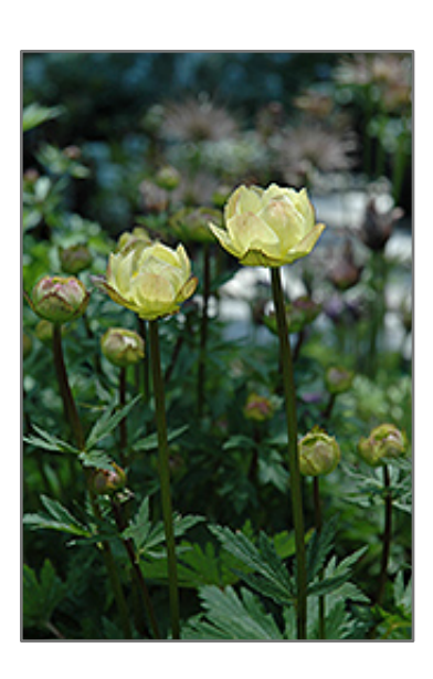
Alabaster Globeflower flowers

A very popular perennial that bursts into bloom in late spring or early summer with pretty butter yellow blooms; likes even moisture, consider adding a summer mulch around the base; cut back after blooming to encourage a flush of new leaves for summer