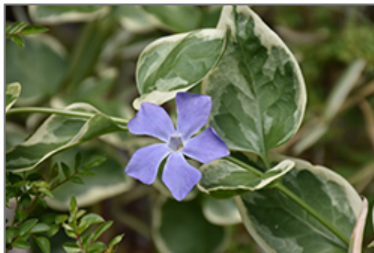
Variegated Periwinkle flowers