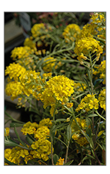
Alpine Alyssum flowers

This hardy variety is perfect for edging a sunny border or accenting a rock garden; yellow flower clusters appear above a mounded cushion of leaves in mid to late spring; evergreen in mild winter areas and drought tolerant once established