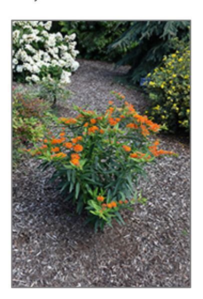
Gay Butterflies Butterfly Weed in bloom

Gay Butterflies Butterfly Weed is recommended for the following landscape applications;