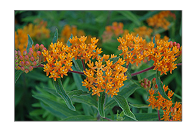
Gay Butterflies Butterfly Weed flowers

This is a relatively low maintenance plant, and is best cleaned up in early spring before it resumes active growth for the season. It is a good choice for attracting butterflies to your yard, but is not particularly attractive to deer who tend to leave it alone in favor of tastier treats. It has no significant negative characteristics.