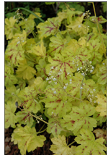
Solar Power Foamy Bells flowers