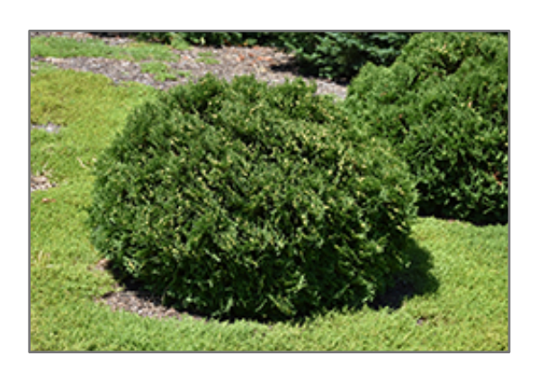
Little Gem Arborvitae

A compact, mounded evergreen detail shrub, slow growing, ideal for general garden use, beautiful in groupings; hardy and adaptable, best with adequate sun, protect from drying winds