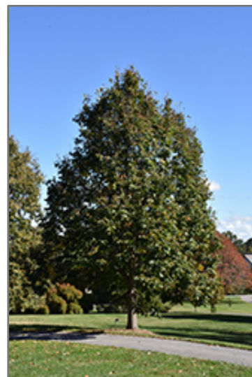
Redmond Linden

Redmond Linden is recommended for the following landscape applications;