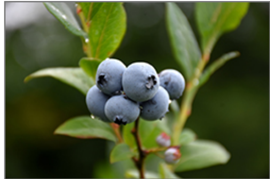
Northsky Blueberry fruit