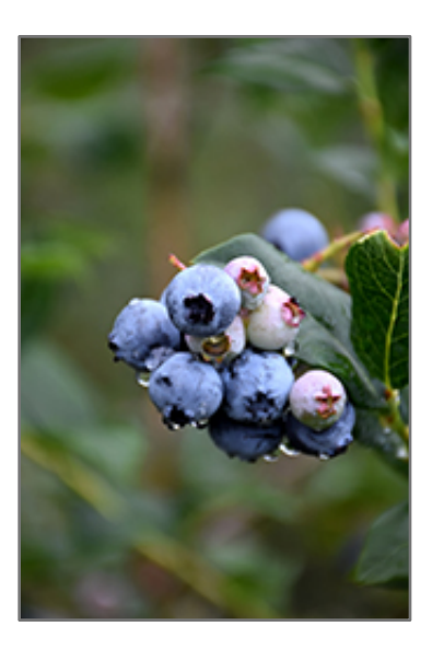
Chippewa Blueberry fruit

Chippewa Blueberry features dainty clusters of white bell-shaped flowers with shell pink overtones hanging below the branches in mid spring. It has green deciduous foliage. The glossy oval leaves turn an outstanding orange in the fall. It features an abundance of magnificent blue berries in mid summer.