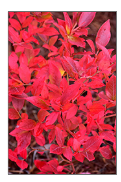
Chippewa Blueberry in fall