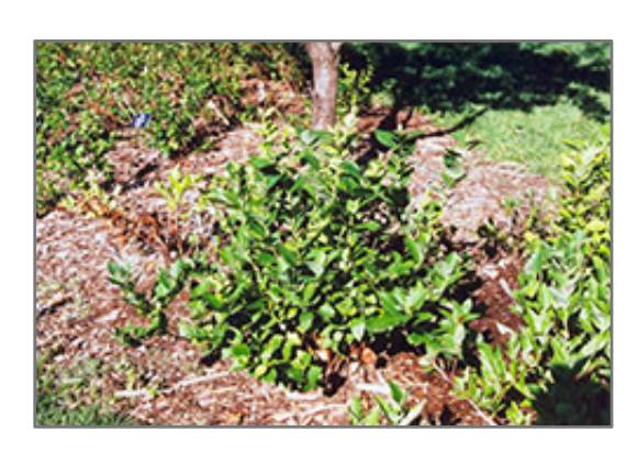
Polaris Blueberry