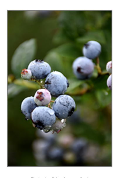
Polaris Blueberry fruit