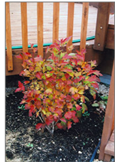
Compact Highbush Cranberry in fall