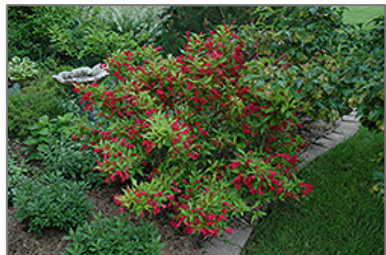
Red Prince Weigela in bloom