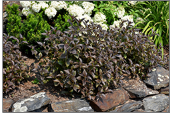
Tango Weigela

Tango Weigela makes a fine choice for the outdoor landscape, but it is also well-suited for use in outdoor pots and containers. With its upright habit of growth, it is best suited for use as a 'thriller' in the 'spiller-thriller-filler' container combination; plant it near the center of the pot, surrounded by smaller plants and those that spill over the edges. It is even sizeable enough that it can be grown alone in a suitable container. Note that when grown in a container, it may not perform exactly as indicated on the tag - this is to be expected. Also note that when growing plants in outdoor containers and baskets, they may require more frequent waterings than they would in the yard or garden. Be aware that in our climate, most plants cannot be expected to survive the winter if left in containers outdoors, and this plant is no exception. Contact our experts for more information on how to protect it over the winter months.