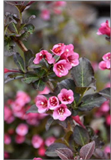
Tango Weigela flowers

Tango Weigela is recommended for the following landscape applications;