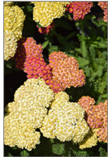
Desert Eve Terracotta Yarrow flowers