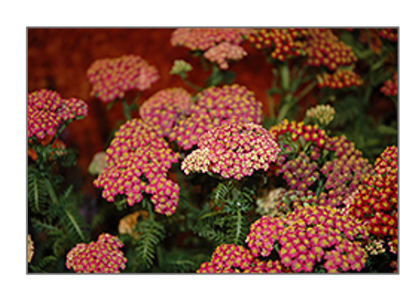
New Vintage Rose Yarrow flowers

Lovely rose flowers with good color retention, and no gap between flowers and foliage; an attractive container plant; excellent for xeriscaping and hot, sunny, dry locations in the garden; performs well on hot sites