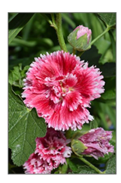
Fiesta Time Hollyhock flowers

Beautiful, double cerise flowers with rose pink ruffled edges on a more compact plant; this biennial is tolerant to the natural toxin formed by the roots of Black Walnut, but can be susceptible to Japanese beetles; plant in full sun for better growth