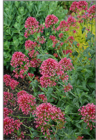
Red Valerian flowers

Red Valerian is recommended for the following landscape applications;