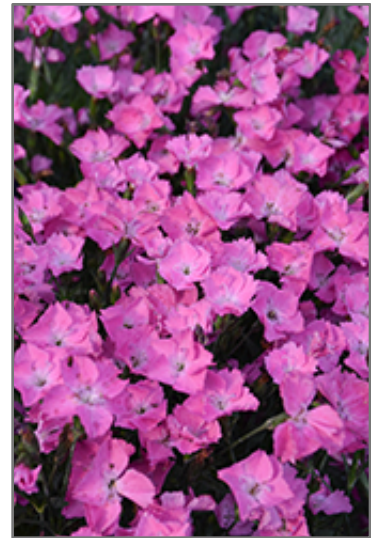
Beauties Kahori Pink Pinks flowers

Beauties Kahori Pink Pinks is recommended for the following landscape applications;