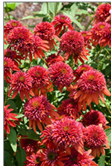
Double Scoop Orangeberry Coneflower flowers

Double Scoop Orangeberry Coneflower is recommended for the following landscape applications;