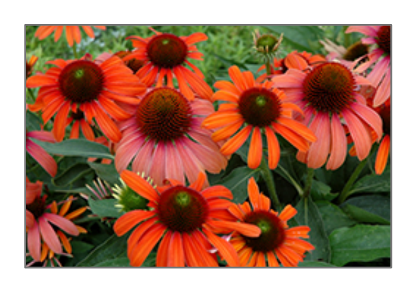
Julia Coneflower flowers

Vibrant tangerine orange, fragrant flowers with large copper cones produced on very strong, well branched stems; attracts pollinators and feeds the birds in winter; use in naturalized areas with other native plants