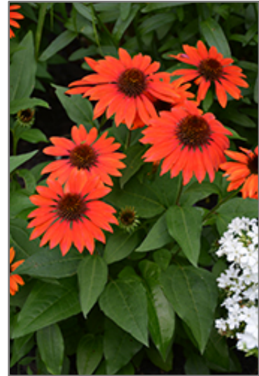
Sombrero Flamenco Orange Coneflower in bloom

Sombrero Flamenco Orange Coneflower is recommended for the following landscape applications;