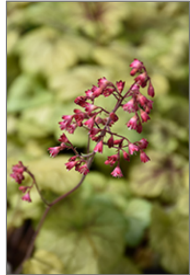
Circus Coral Bells flowers

* This is a 'special order' plant - contact store for details