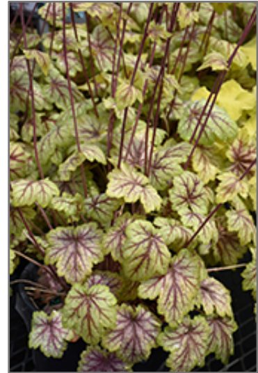
Circus Coral Bells foliage

Circus Coral Bells is recommended for the following landscape applications;