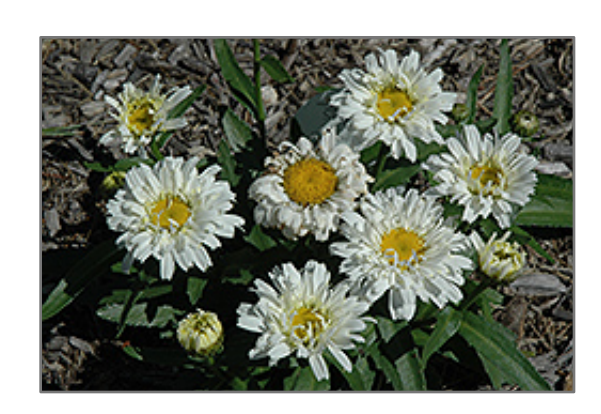
Freak! Shasta Daisy flowers

A compact, well branched variety producing frilly white double blooms with golden centers; a beautiful addition to the garden when massed; hardy and blooms throughout the season without pinching; great for containers