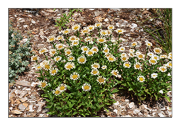
Lacrosse Shasta Daisy in bloom