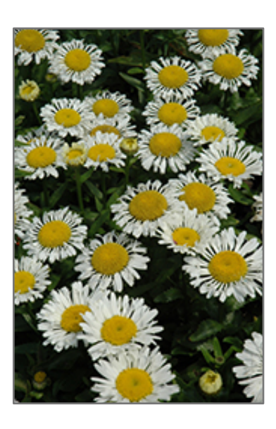
Lacrosse Shasta Daisy flowers

This plant will require occasional maintenance and upkeep. Trim off the flower heads after they fade and die to encourage more blooms late into the season. It is a good choice for attracting butterflies to your yard. Gardeners should be aware of the following characteristic(s) that may warrant special consideration;