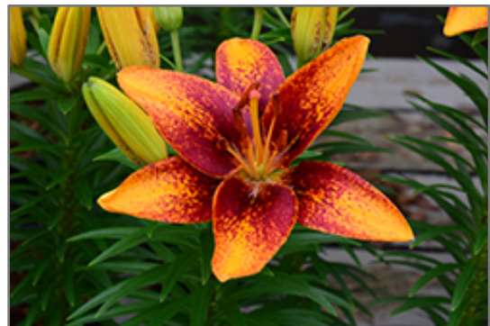
Lily Looks Tiny Orange Sensation Lily flowers