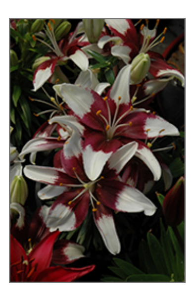
Lily Looks Tiny Padhye Lily flowers

This compact variety produces deep plum blooms with stunning white petal tips; perfect for garden containers, massing, or border plantings; tends to have more blooms per stem than most lilies, which will definitely make an impact in the garden