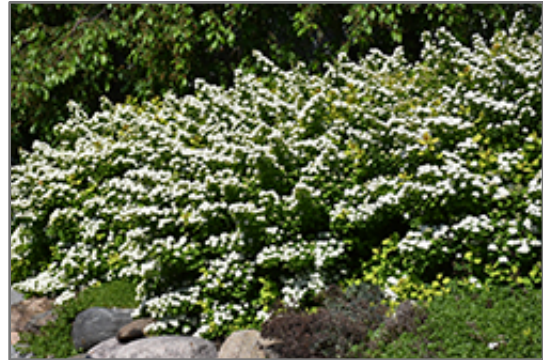
Glow Girl Birch Leaf Spirea in bloom

Glow Girl Birch Leaf Spirea is recommended for the following landscape applications;