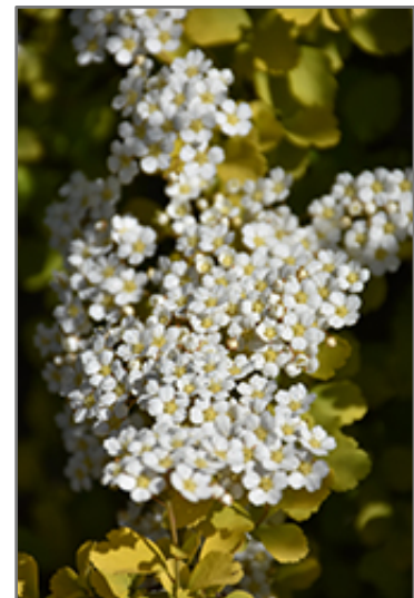
Glow Girl Birch Leaf Spirea flowers