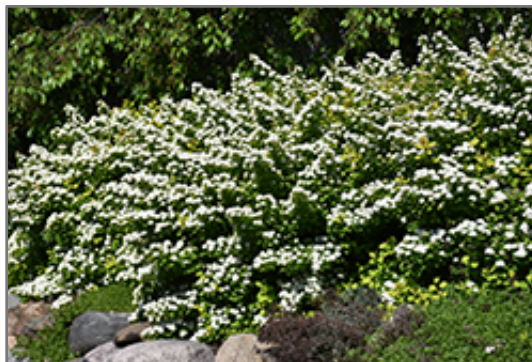
Glow Girl Birch Leaf Spirea in bloom

Glow Girl Birch Leaf Spirea is recommended for the following landscape applications;