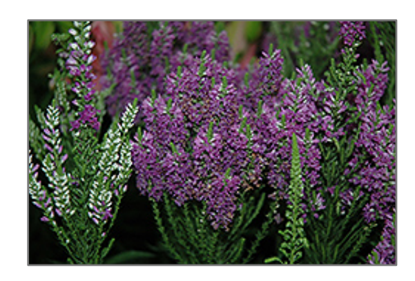
Purple Explosion Speedwell flowers