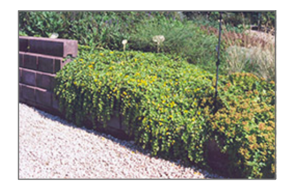
Creeping Jenny in bloom