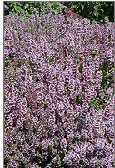
Mother-of-Thyme in bloom

This plant will require occasional maintenance and upkeep, and is best cleaned up in early spring before it resumes active growth for the season. Deer don't particularly care for this plant and will usually leave it alone in favor of tastier treats. Gardeners should be aware of the following characteristic(s) that may warrant special consideration;