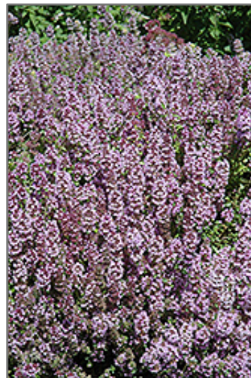
Mother-of-Thyme in bloom

This plant will require occasional maintenance and upkeep, and is best cleaned up in early spring before it resumes active growth for the season. Deer don't particularly care for this plant and will usually leave it alone in favor of tastier treats. Gardeners should be aware of the following characteristic(s) that may warrant special consideration;