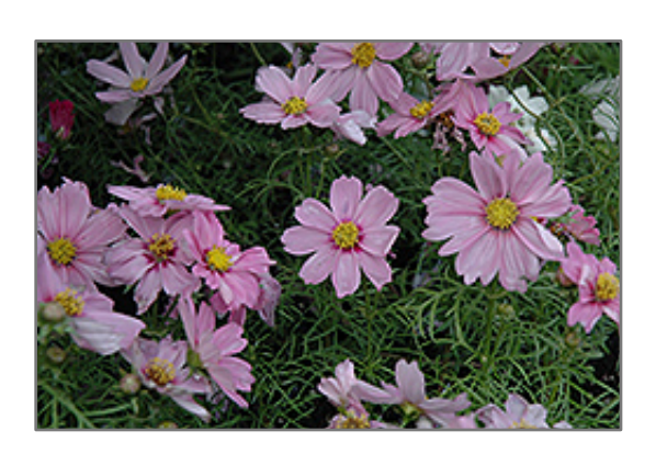
Sonata Pink Blush Cosmos flowers

A vigorous variety, sure to thrive in any garden; free flowering with a well branched habit; attractive pink flowers with hot pink rings over the lacy foliage, gives an airy touch to the garden; best in full sun; tolerates poor soil, heat and humidity