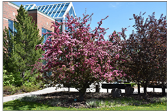
Makamik Flowering Crab in bloom

Makamik Flowering Crab is recommended for the following landscape applications;