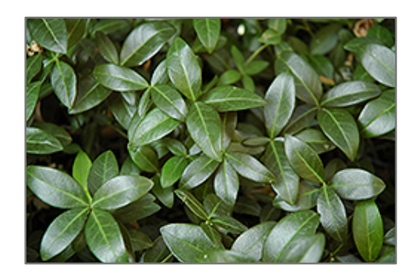
Bowles Periwinkle foliage