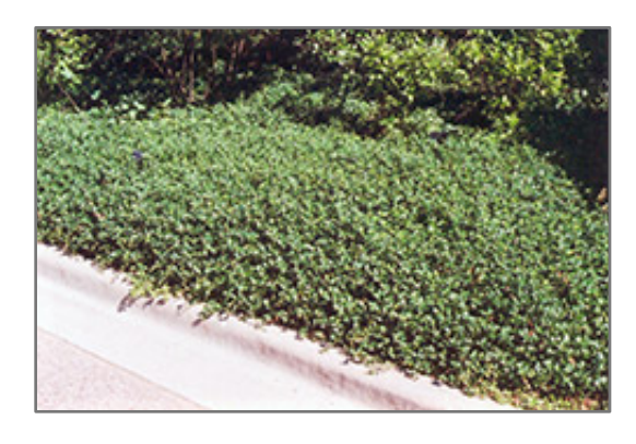
Bowles Periwinkle