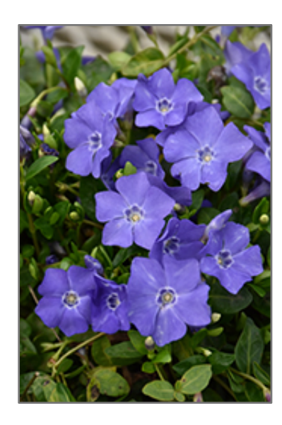
Bowles Periwinkle flowers

Bowles Periwinkle is an herbaceous evergreen perennial with a ground-hugging habit of growth. Its medium texture blends into the garden, but can always be balanced by a couple of finer or coarser plants for an effective composition.