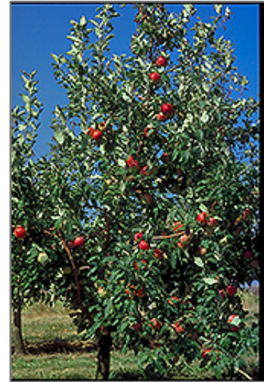
Zestar Apple fruit

This tree is typically grown in a designated area of the yard because of its mature size and spread. It should only be grown in full sunlight. It prefers to grow in average to moist conditions, and shouldn't be allowed to dry out. It is not particular as to soil type or pH. It is highly tolerant of urban pollution and will even thrive in inner city environments. This particular variety is an interspecific hybrid.