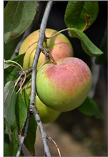
Zestar Apple fruit

Zestar Apple features showy clusters of lightly-scented white flowers with shell pink overtones along the branches in mid spring, which emerge from distinctive pink flower buds. It has forest green deciduous foliage. The pointy leaves turn yellow in fall. The fruits are showy red apples with hints of yellow, which are carried in abundance from late summer to early fall. The fruit can be messy if allowed to drop on the lawn or walkways, and may require occasional clean-up.