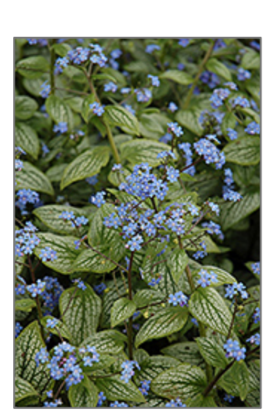
Silver Heart Bugloss flowers

Attractive, large heart shaped leaves are green veined, with silver overlay; clusters of tiny blue flowers in spring; best in moist, rich, well drained soil