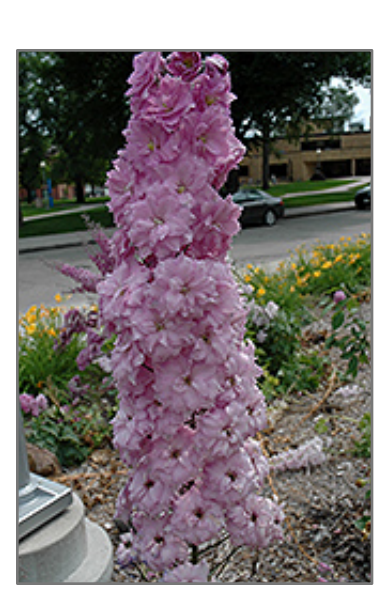
Blushing Brides Larkspur flowers

A magnificent display of rose, to soft dusky pink double flowers on towering spikes with brown or white bees; good vertical form, dense flower spikes and strong stems; excellent uniformity