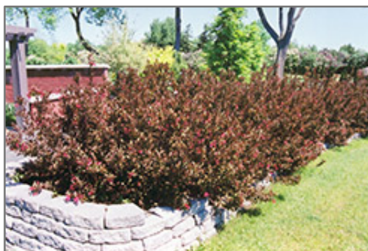
Wine and Roses Weigela