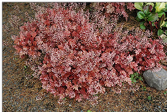
Peach Crisp Coral Bells in bloom

This is a relatively low maintenance plant, and should be cut back in late fall in preparation for winter. It is a good choice for attracting hummingbirds to your yard. It has no significant negative characteristics.