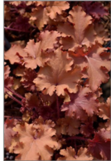
Peach Crisp Coral Bells foliage

Peach Crisp Coral Bells will grow to be about 14 inches tall at maturity extending to 20 inches tall with the flowers, with a spread of 18 inches. When grown in masses or used as a bedding plant, individual plants should be spaced approximately 15 inches apart. Its foliage tends to remain dense right to the ground, not requiring facer plants in front. It grows at a medium rate, and under ideal conditions can be expected to live for approximately 10 years. As an evergreen perennial, this plant will typically keep its form and foliage year-round.