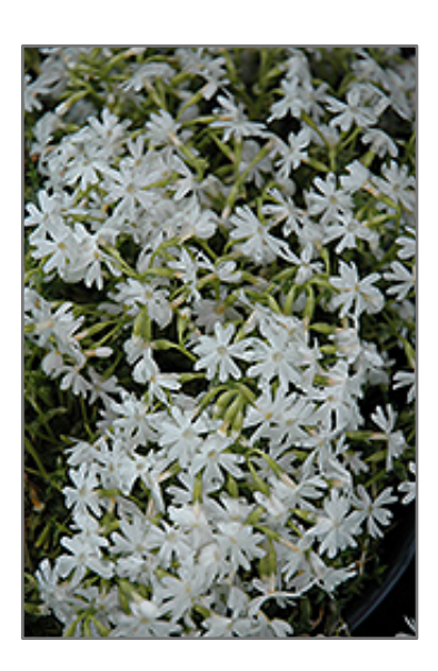
Snowflake Phlox flowers

This variety produces a showy carpet of bright white flowers shining in the spring sun; prune lightly after flowering to encourage a dense growth habit; wonderful for rock gardens, edging, or in mixed containers