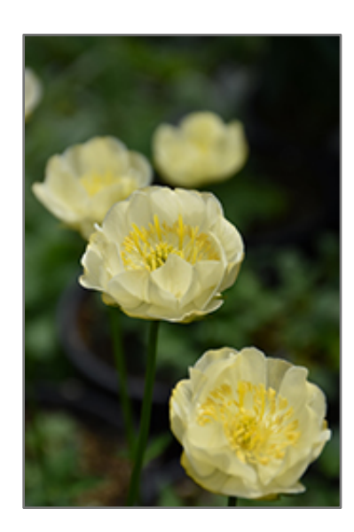
New Moon Globeflower flowers

A very popular perennial that bursts into bloom in late spring or early summer with pretty butter yellow blooms; likes even moisture, consider adding a summer mulch around the base; cut back after blooming to encourage a flush of new leaves for summer