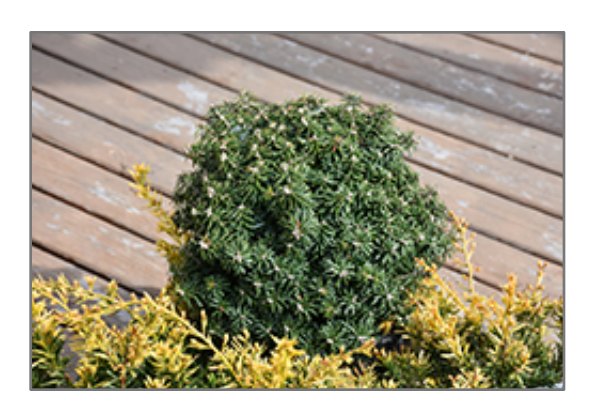
Cis Dwarf Korean Fir

A beautiful dwarf conifer that grows extremely slowly to form a mounded ball; lighter green emerging foliage in spring contrasts with the older needles; ideal for a rock garden, particular as to siting