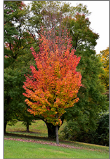
Red Rocket Red Maple in fall

This is a relatively low maintenance tree, and should only be pruned in summer after the leaves have fully developed, as it may 'bleed' sap if pruned in late winter or early spring. It has no significant negative characteristics.