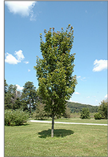
Red Rocket Red Maple

This tree should only be grown in full sunlight. It is quite adaptable, preferring to grow in average to wet conditions, and will even tolerate some standing water. It is not particular as to soil type, but has a definite preference for acidic soils, and is subject to chlorosis (yellowing) of the foliage in alkaline soils. It is somewhat tolerant of urban pollution. This is a selection of a native North American species.