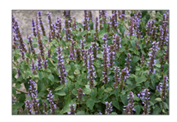
Little Adder Hyssop flowers

Easy-to-care for perennial flowers on airy spikes add lovely texture to any garden; radiant lavender-purple color; a favorite for butterflies and hummingbirds; soothing, aromatic, licorice scented foliage for the fragrant garden